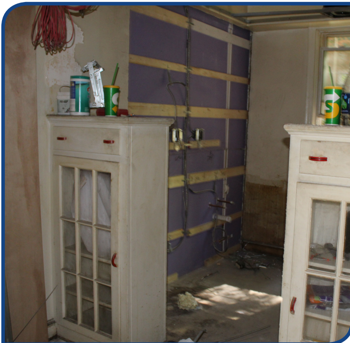
Fort Stevens Before