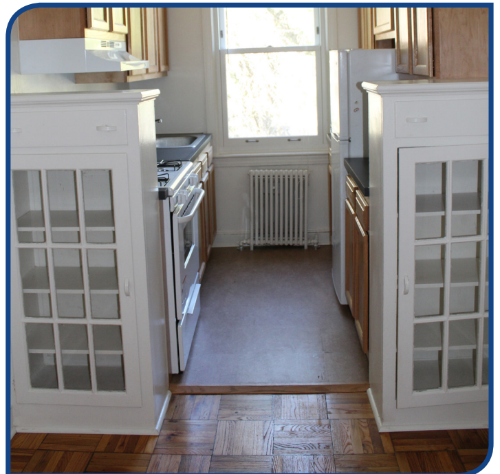
Fort Stevens After