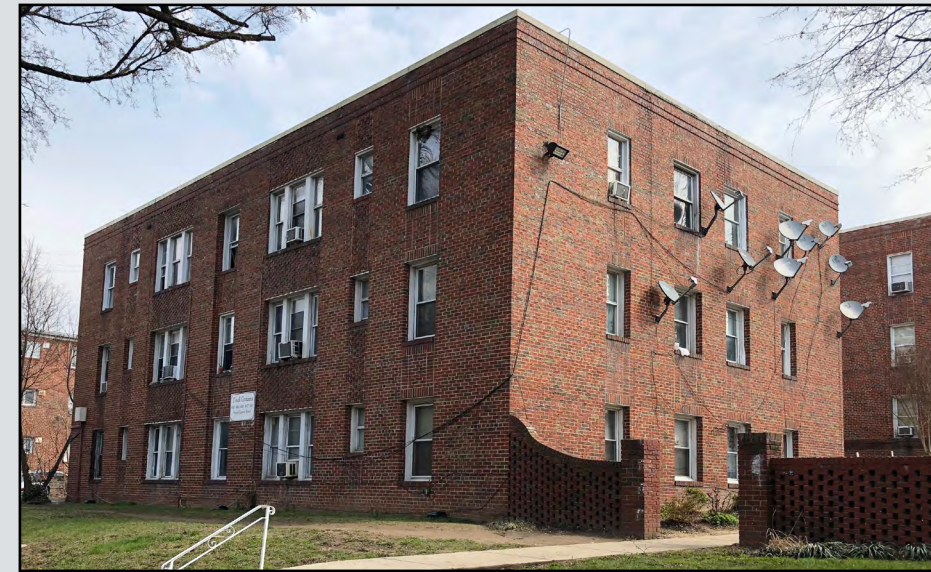
New units of affordable housing in Washington DC's 8th Ward at MANNA's new development, Hanover Courts.

MANNA recently broke ground on new developments in Wards 5 and 8. Together, the new Hanover Courts and Tivoli Gardens developments create 131 new units of affordable rental housing.